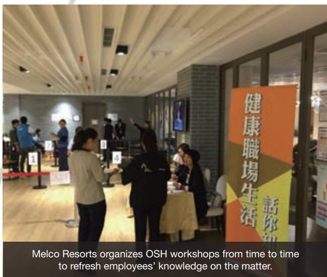
Melco Resorts organizes OSH workshops from time to time to refresh employees' knowledge on the matter.

To recognize our employees' efforts in improving OSH performance, our OSH Awards Programme has been offering quarterly cash prizes for eight consecutive years to employees who contribute the most to workplace safety. To promote the safety-first mindset to our employees, we also broadcast monthly OSH information updates via our internal employee television network in all staff common areas in Macau.