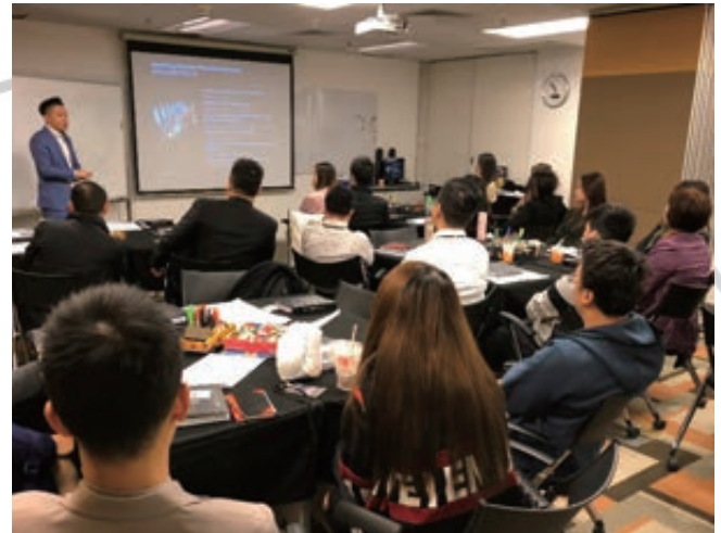
All employees at Melco Resorts are required to complete mandatory responsible gaming training as part of the onboarding process.

Internal investigations are conducted for every reported workplace accident. Once an accident has been reported to our Human Resources Department, the Accident Form is shared with the OSH Committees, which are responsible for conducting follow up investigations. Relevant corrective actions are to be taken to prevent the occurrence of similar accidents. Our Hazard and Near Miss Reporting Programme also prevents accidents by reporting and rectifying an unsafe situation before the occurrence of any potential injuries.