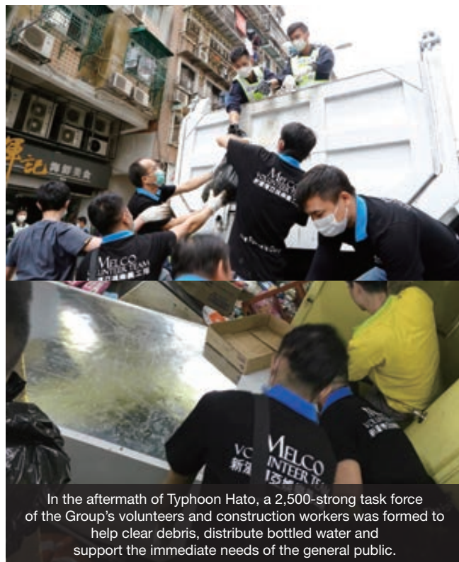
In the aftermath of Typhoon Hato, a 2,500-strong task force of the Group's volunteers and construction workers was formed to help clear debris, distribute bottled water and support the immediate needs of the general public.

The devastating impacts of Typhoon Hato on the community will leave a lasting imprint on the memory for every citizen in Macau. In response to this, we committed to sharing our collective resources to swiftly support and restore the community. We promptly created a MOP $30M Cash Relief Fund and a Volunteer Task Force to support employees, the community and the restoration efforts in the aftermath of Typhoon Hato in Macau. As an immediate action, we halted the construction of our new Morpheus hotel tower and reassigned all 2,000 construction workers to join government-led efforts to assist and restore the city's most affected areas. We also quickly mobilized our dedicated volunteers to help impacted residents and businesses by clearing debris on the streets, distributing bottled water and necessities, and supporting the general public with immediate needs. We are pleased to leverage our community efforts, which enabled the city swiftly recovered from the disaster.