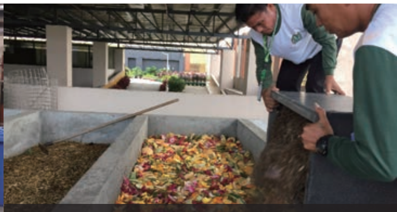
City of Dreams Manila actively manages food waste by commissioning a kitchen waste recycling initiative to transform organic waste into nutrient-rich fertilizer for gardening.

To utilize the kitchen waste produced from food and beverages outlets, City of Dreams Manila has adopted vermicomposting to transform organic waste into nutrient-rich fertilizer. During the composting process, African Night Crawler worms are used and added to the mixture of vegetables, fruit peels, and garden debris to produce nutrient-rich organic fertilizer for gardening within the property. With the implementation of the initiative, City of Dreams Manila is able to save an approximately 15% of gardening consumable expenses each quarter and reduce the use of chemical fertilizer and pesticides, enabling sustainable practices in gardening and promoting environmental safety and health in the operations.