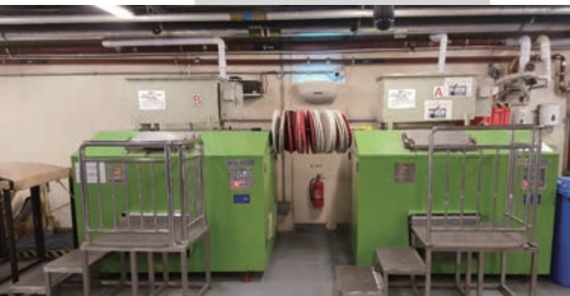
Biodegradable food waste decomposers are installed at City of Dreams to convert food wastage into organic fertilizer.