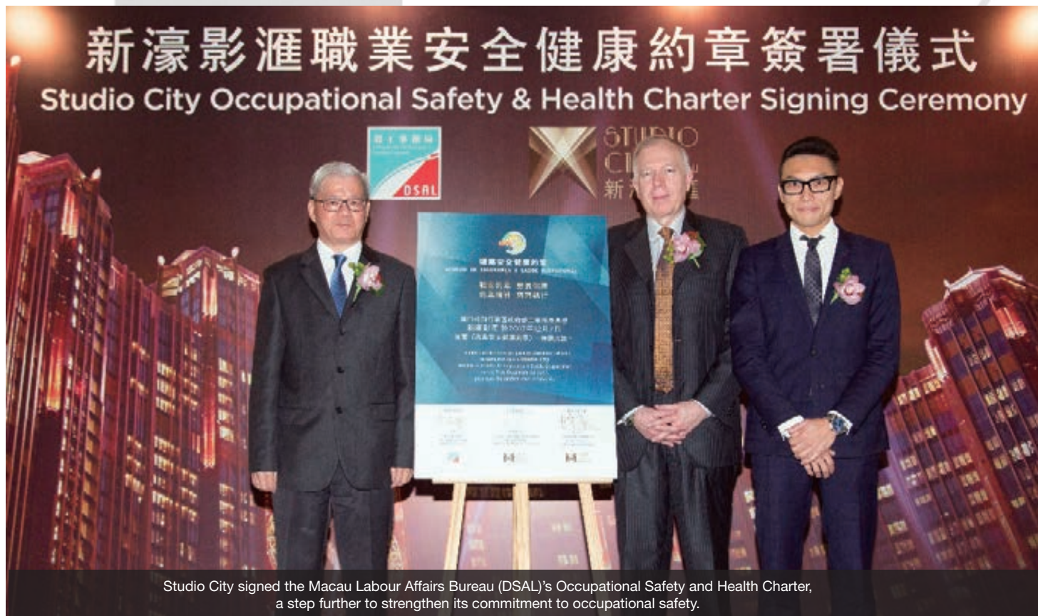
Studio City signed the Macau Labour Affairs Bureau (DSAL)'s Occupational Safety and Health Charter, a step further to strengthen its commitment to occupational safety.